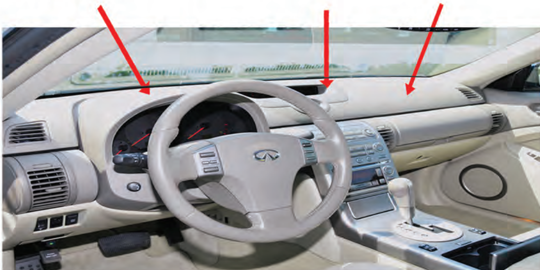
Recommended Installation placement

Determine a suitable mounting location under the top dashpad for the GPS unit. Ideal locations are directly under the dashpad skin, above the glove box, or above the gauge cluster. Do not glue the top of the GPS unit directly to the bottom of the dashpad.